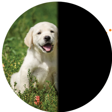
Neurological Vision Impairment (NVI)