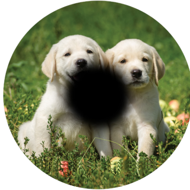
Age-related Macular Degeneration